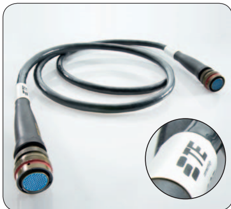
The WM-SCE heat-shrinkable wrap-around marker can be installed on 'live circuits' as well.